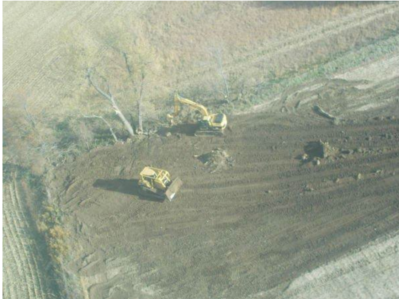
Removing tree lines and fence lines to gain additional ground